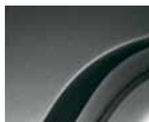
WXA LAVA GREY (METALLIC)