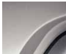
HXA MINERAL BEIGE (METALLIC)