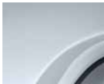
QXB WHITE (SOLID)