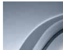
KXC ULTRA SILVER (METALLIC)