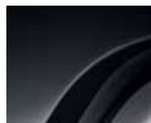
GXA BLACK (METALLIC)

It should be noted that printing limitations do not permit the subtle paintwork shades on these pages to be shown with absolute accuracy. Only personal inspection of the Koleos at your Renault Dealer will reveal it in its true colours. From time to time changes are made to the colour range. Please check availability with your Renault Dealer.