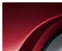
NXA VENETIAN RED (METALLIC)