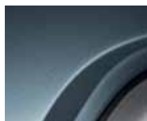
RXA STEEL BLUE (METALLIC)