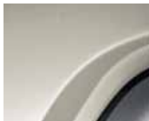
QXA PEARL WHITE (METALLIC)