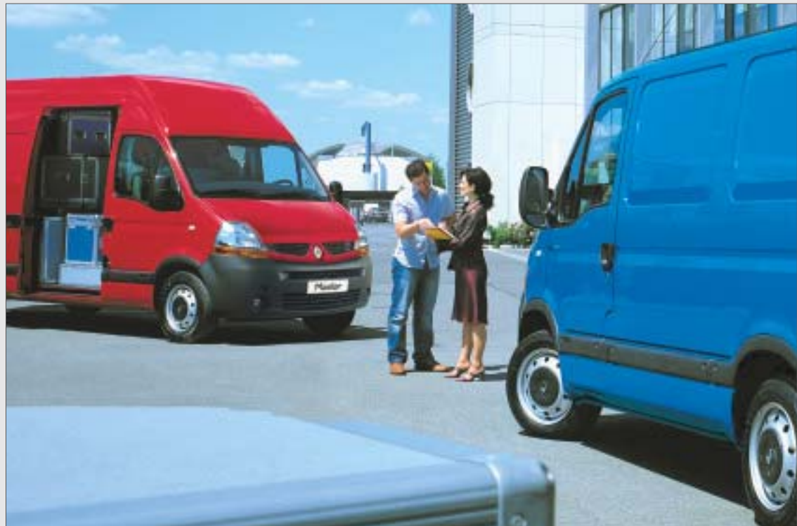
Overseas model shown for illustrative purposes only.