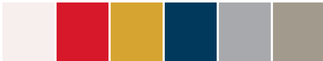
D31 APOLLO WHITE (SOLID) C70 LASER RED (SOLID) D32 DESERT YELLOW (SOLID) J43 PANORAMA BLUE (METALLIC) G64 LIGHTNING GREY (METALLIC) C66 TOPAZ GREY (METALLIC)

It should be noted that printing limitations do not permit the subtle paintwork shades on these pages to be shown with absolute accuracy. Only personal inspection of the Traffic at your Renault Dealer will reveal it in its true colours. From time to time changes are made to the colour range. Please check availability with your Renault Dealer.